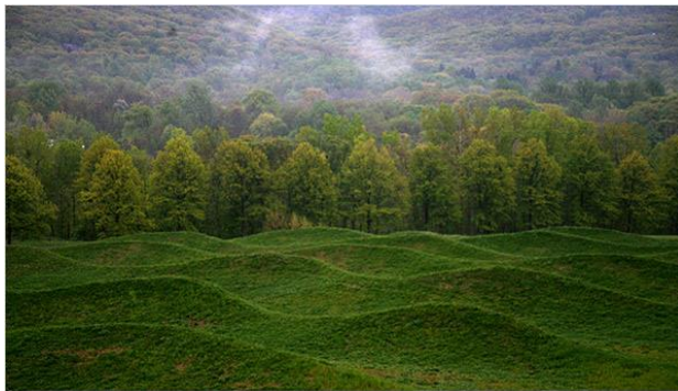
"Storm King Wavefield"

Maya Lin's new work at the Storm King Art Center, occupies a former gravel pit