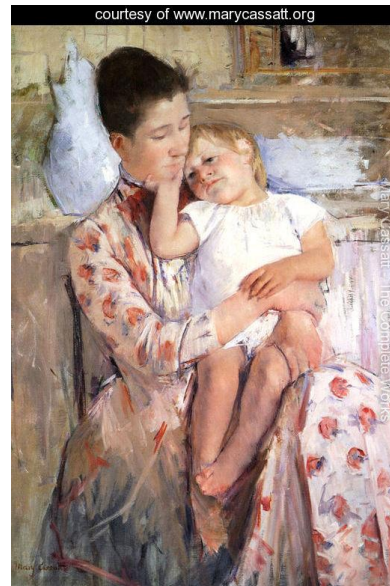
Mother and Child