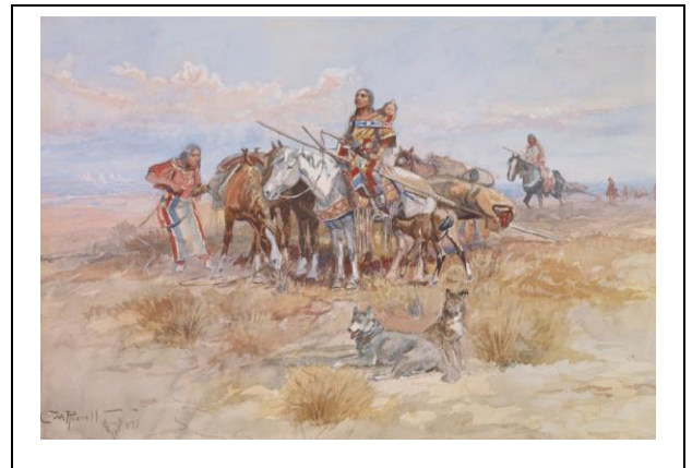
Charles M. Russell (1864-1926), Breaking Camp , 1897, watercolor (C.M.Russell Museum, gift of Great Falls Businessmen)