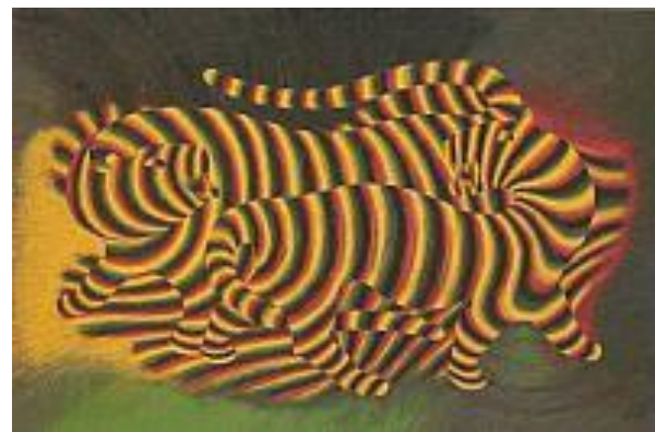
Works by our April Artist "Victor Vasarely"